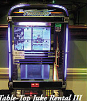
Table-Top Juke Rental III