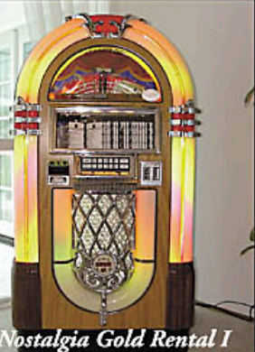
Nostalgia Gold Rental I